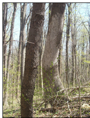
Black cherry on left, yellow poplar (also known as tulip tree) on right.

Their bark allows you to ID Even when there ain't no leaves.