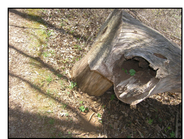
Ginger in tree hollow to right along trail.

Mystery #2: Ahead on the right a fallen tree In the hollow a heart-shaped leaf. Wild ginger, leave it be. It's not the kind we use in _____.